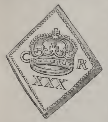
Newark Siege Piece.

monuments perished, as national ones had done by the sacrifices at Oxford and at the Tower. The first of this sort of money, since called siege pieces, was coined at