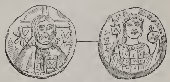
Gold coin of Michal Ducas.

The later inscriptions on this series of coins are in a strange jumble of Greek and Latin characters and terms, being sometimes all Greek.